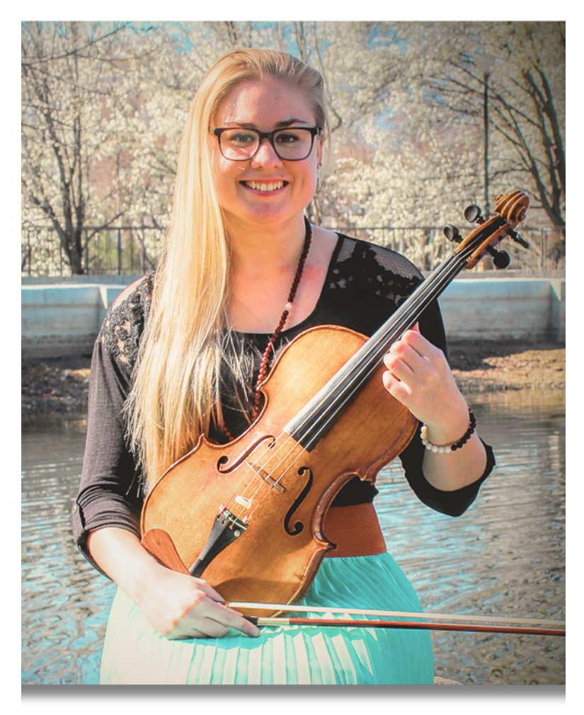
To My Valued Students and Family,

As an instructor, I aspire to mold all ages, helping them become well-rounded, intentional, thoughtful spirits, using violin, viola, cello, or piano, as their main resource for growth.